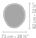
Mirror 82 x 72