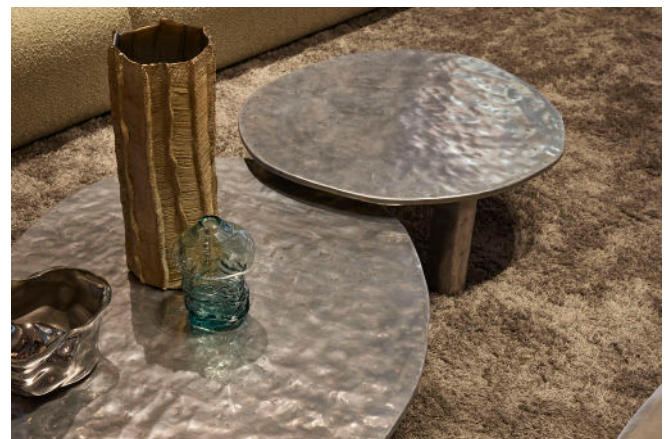
Coffee table 120 x 90