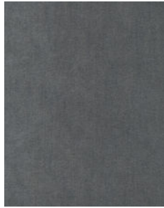
VENEZIA 1716 PG 9