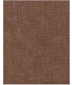
VENEZIA 0513 PG 6