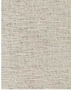
VENEZIA 0123 PG 6