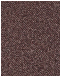
VENEZIA 2212 PG 6