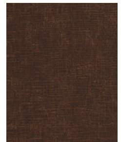
VENEZIA 1015 PG 6