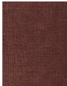
VENEZIA 0824 PG 6