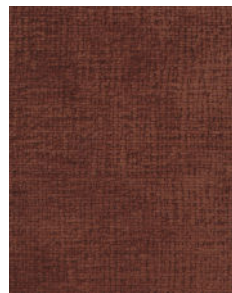
VENEZIA 0916 PG 6