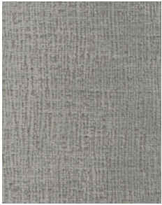
VENEZIA 1610 PG 6