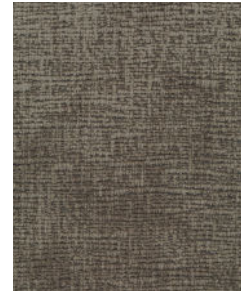
VENEZIA 1509 PG 6