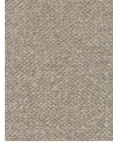
VENEZIA 0401 PG 6