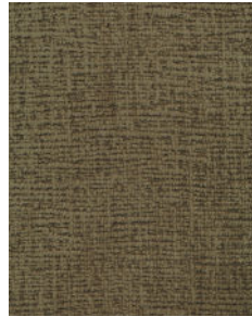
VENEZIA 1306 PG 6