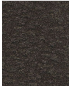
VENEZIA 1210 PG 7