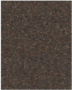
VENEZIA 1118 PG 6