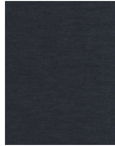
VENEZIA 1922 PG 9