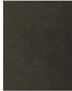
VENEZIA 1415 PG 9