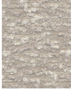
VENEZIA 0204 PG 7