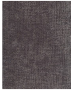
VENEZIA 1819 PG 6