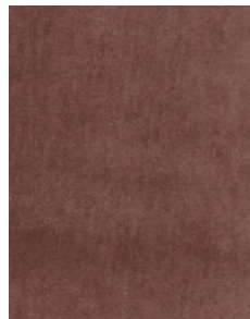
VENEZIA 0706 PG 9