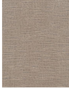
VENEZIA 0303 PG 6