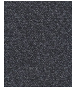
VENEZIA 2014 PG 6