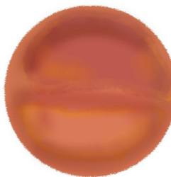
carpet gradient gravel can be ordered in circle size up to Ø 400cm