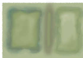
carpet gradient moss the ratio will always be 2:3