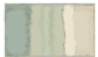
carpet gradient chalk the ratio will always be 2:3