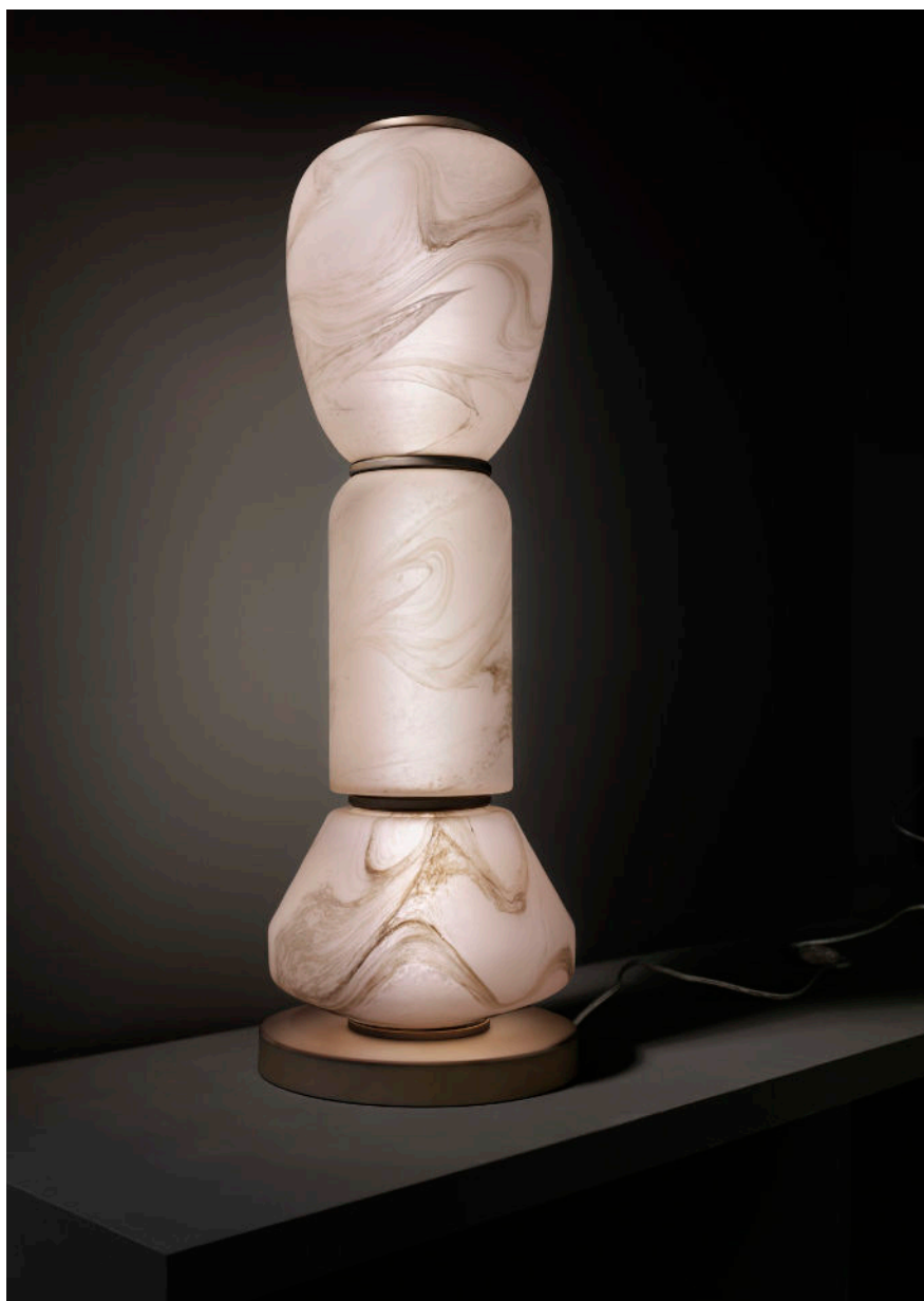
pendant light vertical