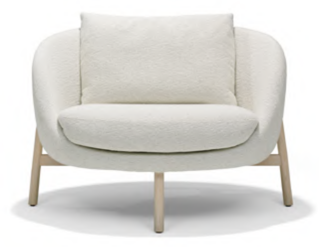
HEATH ARMCHAIR design by Yabu Pushelberg

https://linteloo.com/collection/armchairs/